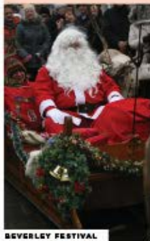
BEVERLEY FESTIVAL OF CHRISTMAS

With over 80 stalls, Santa on his sleigh, live reindeer, exhibitions and Victorian fair with childrens rides - full programme of street entertainment.